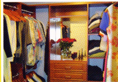
The finished project—a closet where everything is easy to find!