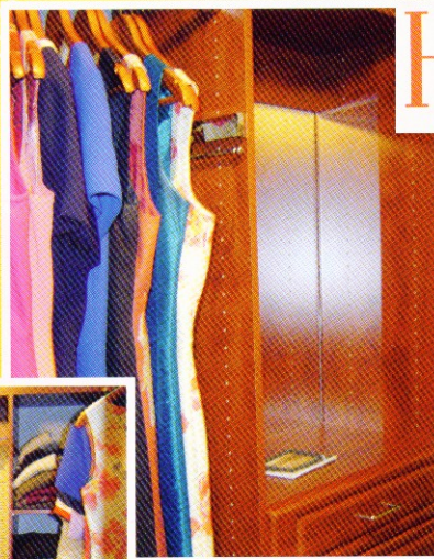
Wooden cabinets installed in the closet created more walking space